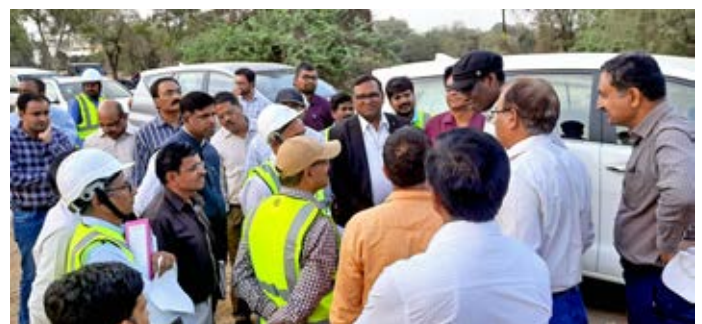
On Site Dialogue with Stakeholders - EPC: Mehsana-Sidhpur

GSHP-II Interim Technical mission visited the state from February 25 th to 28 th 2020. Site visits were carried out on February 25 th and 27 th to all ongoing packages including EPC and OPRC contracts. CE (WB) and PIU welcomed Mission members of the World Bank including Task Team Leader (TTL), Highway Expert and Operations Analyst. The World Bank Team along with CE-PD, SE-PIU, PIU Officers and PMC Team visited and reviewed the EPC-04 corridor progress on 25 th February, 2020. EPC1A, EPC 1B, EPC 01C and EPC 02 corridors were visited on 26 th February, 2020. OPRC and EPC-03 packages were visited on 27 th February, 2020. Mission took the stock of progress and passed on advise on way forward for respective packages. The Interim mission concluded on 28 th February 2020 with wrap-up meeting and discussion at GoG.