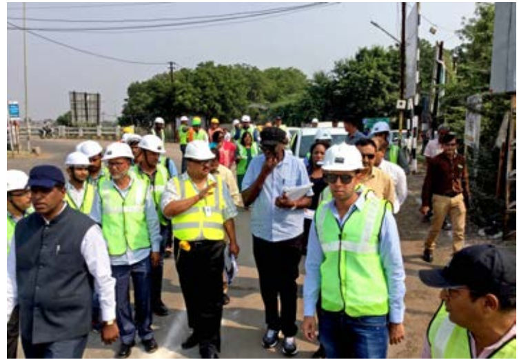
OPRC Site Inspection

The mission concluded on 29 th November 2019 with wrap-up meetings at GoG.