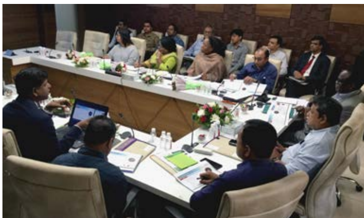
Overall Project Review by WB alongside Secretary-R&BD