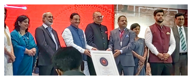
Such appreciation through "SKOCH-GOLD Award in Governance" is the testimony of sincere efforts of the Government of Gujarat and The World Bank along with its stakeholders.

R&BD-GOG received such honor through hands of Honorable Minister for Human Resource Development, Government of India -Dr Ramesh Pokhriyal 'Nishank' in New Delhi on 25th September, 2019.